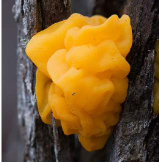
Witch's butter ( Tremella mesenterica )

version of this soup was restrained and subtle in comparison to others we've tried in California, but we found it addictive nonetheless. It's made by double boiling the bitter melon and cooking it down to a light broth, and then adding accent items, mushroom-based or otherwise. Ours featured matsutake mushrooms from Yunnan. In addition, there was a supporting role played by a yellow Tremella that strongly resembled our Tremella mesenterica , the "witch's butter" seen growing on downed wood. This Hong Kong Tremella was added for some color and texture and was itself fairly low-key. This soup, while served at a high-end restaurant, was deceptively simple. But it was so addictively delicious that we could barely restrain ourselves from ordering additional servings.