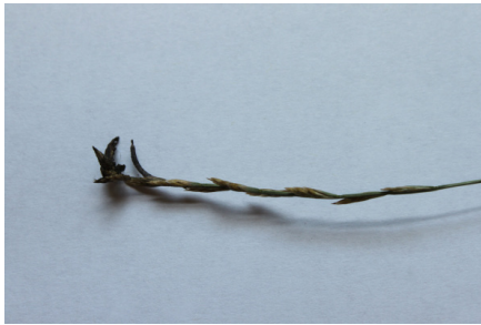
Fig. 2. Ergot ( Claviceps purpurea ) growing on ryegrass ( Lolium sp. ).

if I could swab their foreheads with basically a Q-tip. I ran each swab over a petri dish filled with media containing garlic-infused olive oil. In the first “personal offense”, the petri dish from my own forehead was the only one which grew anything—some nice white and pink yeasts, most likely Malassezia along with some Rhodotorula , a pink yeast that commonly grows in bathrooms. When I tried to isolate each of these types, I saw something curious: the pink yeast appeared to be eating the white yeast. I couldn't help but wonder; was Rhodotorula eating Malassezia —on my face?!