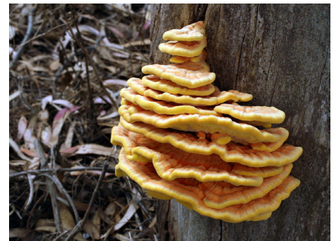
Laetiporus gilbertsonii

Though it is now months since the skimpy sprinkles of our last "rainy" season, this is the time to be on the lookout for the golden yellow and brilliant orange blobs of the chicken of the woods or sulfur shelf mushroom. Check around the bases of Eucalyptus stumps or around cracks and hollows on those living tree trunks in the East Bay hills and peninsula parks for the unnaturally brilliant lumps of gold against the dry and dusty habitat. A lucrative yield might be thirty or more pounds of tender golden, fowl flesh from one stump. Prepared properly it is one of the most versatile, edible mushrooms that you can partake of year round, though it usually only fruits in the hottest, late summer months of August, September, and October.