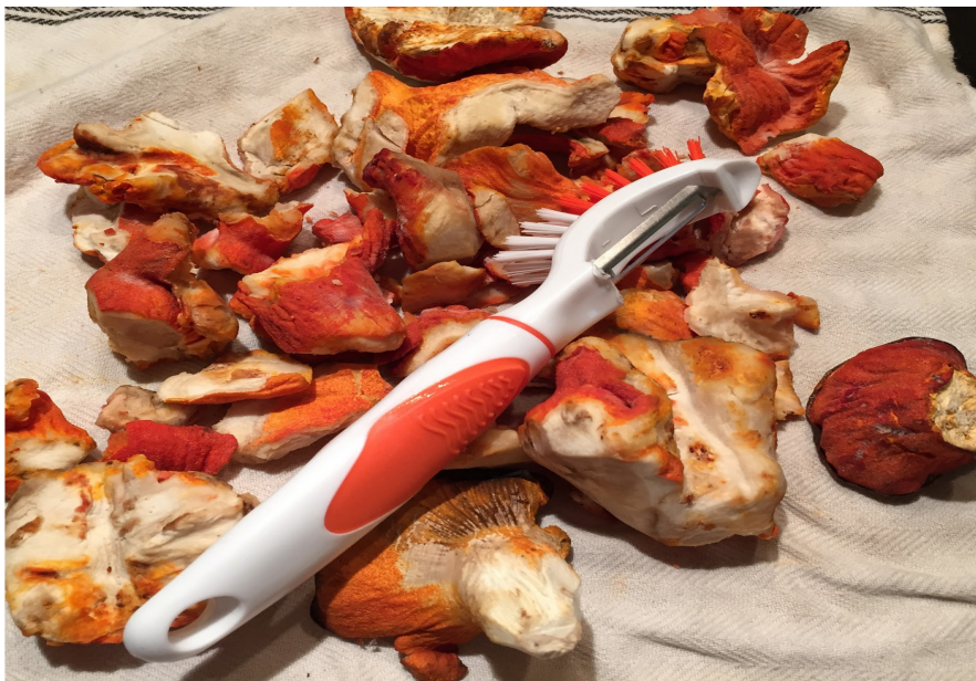
Lobster Mushroom Cleaner Location: Ruidoso, NM, USA Observation created: August 4, 2015

The Dollar Store is a great place to get cheap gear for the frugal mushroom hunter. If you are like me and tend to lose sticks, knives and brushes in the forest, they can be easily replaced. This month, I discovered the best lobster mushroom cleaner. Not only does it come in the color of the of the lobster mushroom (hunter orange), it also cleans the lobster better than any one tool I have in the kitchen. It's intended use is a vegetable brush and peeler combo, but to me, it was made for the lobster mushroom for field or home cleaning. The brush on the tool is extra hard and long so the dirt-filled crevices of the distorted mushroom can easily be cleaned. Any dirt adhering to the base of the mushroom can be simply shaved off with the peeler. It even has a hole in the handle so you can use a carabiner to hook it to your basket or belt buckle.