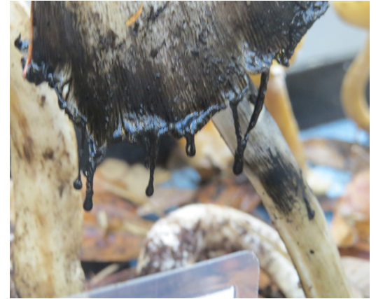
Coprinus on display at MSSF Fungus Fair 2015