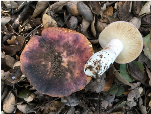
Russula - Oakland, CA