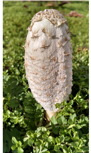
Shaggy Mane from Alameda College © Donald Hughes

Interestingly, the cross sectioned stipe is hollow, and in the hollow chamber you'll find a long white "kite string" of tissue hanging loose connecting the bottom center of the hollow to the center of the top of the chamber at the center of the cap. This is an identifying characteristic of the shaggy mane.