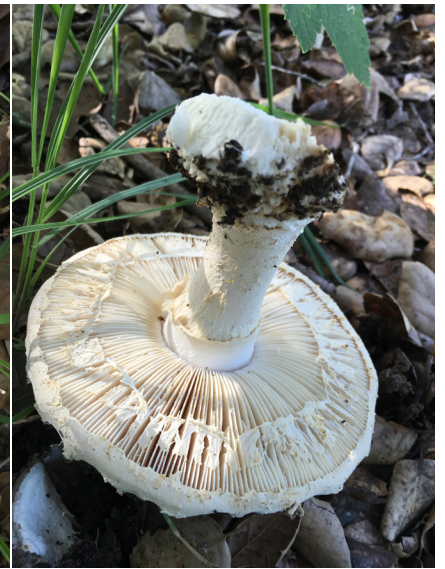
Amanita Subgenus Lepidella - Oakland, CA