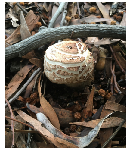
Shaggy Parasol - Oakland, CA