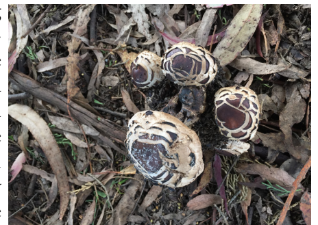
Shaggy Parasol