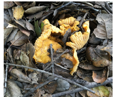
Cantharellus californicus - Oakland, CA

Send photos of your findings to mycenanews@mssf.org to be published in the next newsletter.