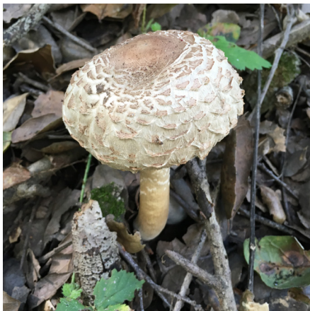
Shaggy Parasol © Pascal Pelous

Button mushrooms and shaggies constitute a lifestyle group of compost feeding saprobic mushrooms that are helpful to learn about as a group. When we say buttons, that's the vulgate name that refers specifically to the members of the taxonomic genus Agaricus . The Agaricus genus encompasses the portobello, crimini, and button mushrooms typically found in the generic produce section of most common grocery stores; it's the mushroom that the average American thinks of when they think of mushrooms as food. The genus is generally divided into the edible half of species that have an anisey-almondy or store bought button mushroom fragrance or flavor, and the nonedible "puker" half of species that usually have a sort of library paste or phenol identifying fragrance which some folks, like myself, genetically can't distinguish. Among the best of the edible local wild buttons are the distinctly anisey-almondy prince and the meaty "salt lover", A. bernardii . But more common, especially in backyard gardens, are the golden puker buttons that stain yellow when rubbed on the base of the stem or the side of the cap, Agaricus xanthodermus .