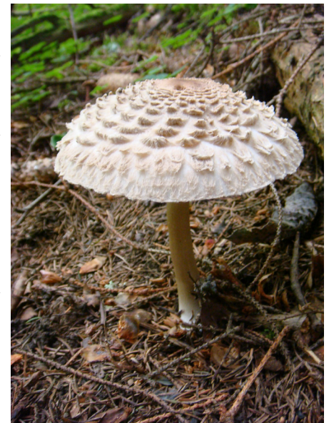
Shaggy Parasol from a Norway trip

Early fruiterers that usually come out with the first rains were finally showing up in late January and early February. I know a reliable Jack O' Lantern that fruited consistently for the last ten years from Thanksgiving through Fungus Fair at the base of a lightning bolted oak. It was just wilting at the beginning of February. Nearby is an oak with a hollow opening at head height and head size that is usually prime during the same Thanksgiving to Fungus Fair window. The hollow was completely crammed with the largest lion's mane that