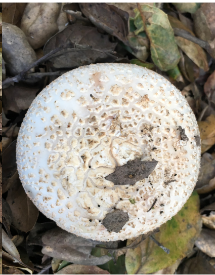
Amanita novinupta - Oakland, CA