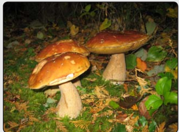
Boletus edulis spotted in the Oregon Cascades.