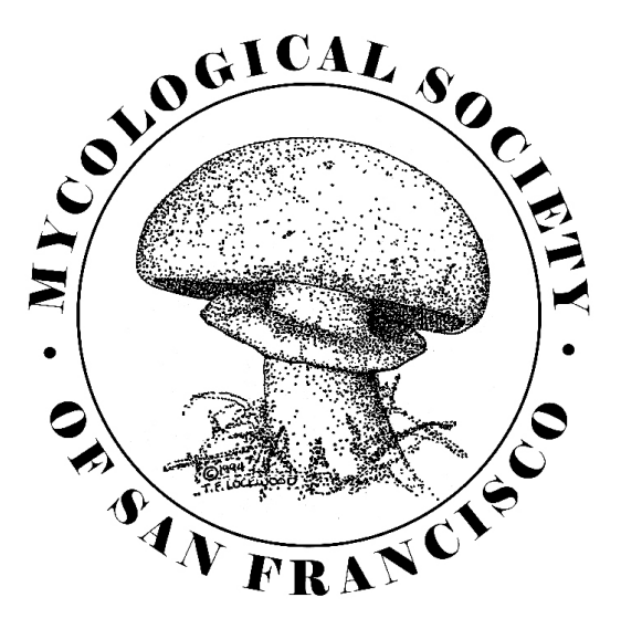
February, 2011, vol. 62:02

Mycological Society of San Francisco c/o The Randall Museum 199 Museum Way San Francisco, CA 94114