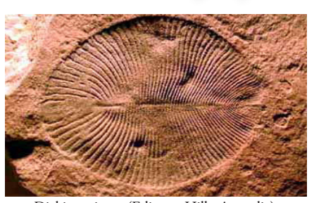
Dickinsonia sp. (Ediacara Hills, Australia)

(Reprinted from Mycena News, November 1995)