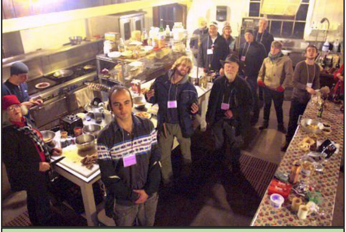
2012 Medocino Woodlands Foray: A Parting Shot Folks in the Mendocino Woodlands kitchen during MycoMendoMondo, late Saturday night, cooking into the wee hours.