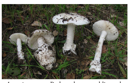
Amanita ocreata Peck under coastal live oak near Capitola, CA.