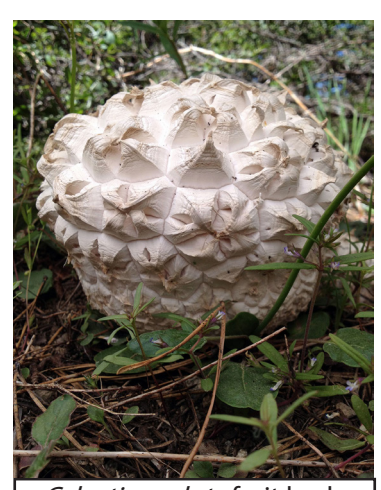
Calvatia sculpta fruit body from Yuba Pass, California

or by completely falling apart and harnessing the kinetic energy of wind (Gregory 1949). There could be a possible correlation with the ornamentation of spores, giving assistance in this dispersal process. Previous studies have shown that many species within the Lycoperdaceae have advanced mechanisms for spore dispersal using drops of rain. This can be seen using ultra high-speed Schlieren cinematography (Gregory 1949, 1976). It was noted in the Gregory (1976) study that species such as Bovista plumbea and Calvatia gigantea both have a sizeable air-filled pedicel attached to the spore, aiding the spore's ejection and landing mechanisms. Further study using wind energy may help to better understand any correlation between dispersal mechanisms and spore ornamentation.