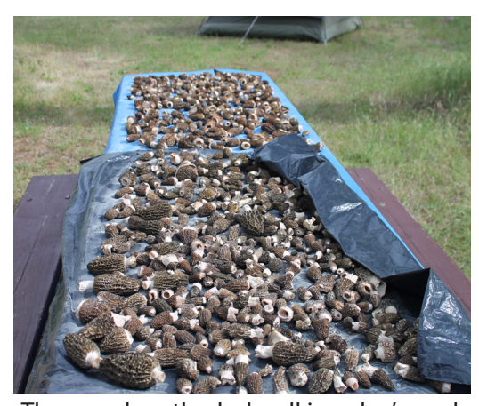
The morel motherlode: all in a day's work

Each weekend, members split into groups and carpooled to stay discreet, as we did not want anyone arrested ticketed for being in the burn zone's closed areas. Inside Yosemite, it was